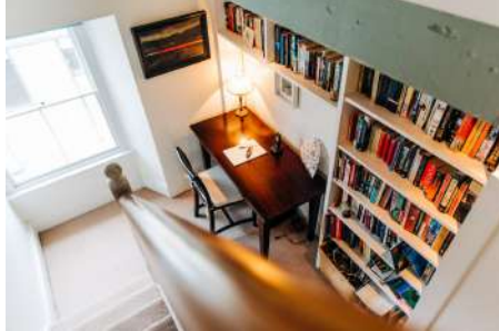
Second Floor Study