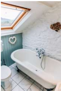
Third Floor Ensuite