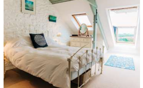
Third Floor Bedroom