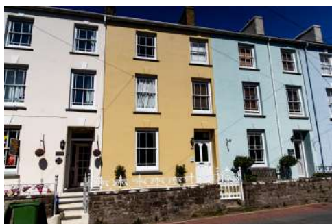
Entrance & Front Terrace