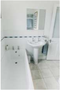
First Floor Family Bathroom