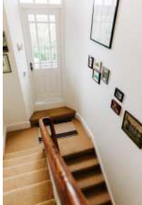
Second Floor Door to Balcony