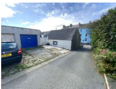
Off St Parking Area