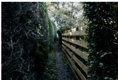
Shared Path to Garden