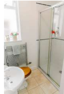
Bedroom 2 Ensuite