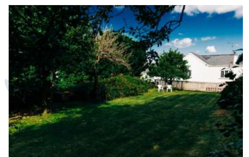
Raised Garden Lawn Area