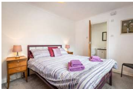
Ensuite Double Bedroom