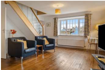
Lounge (stair to first floor)