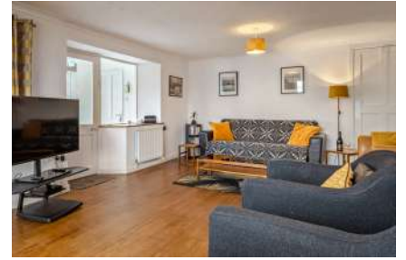
Lounge ( view of porch)