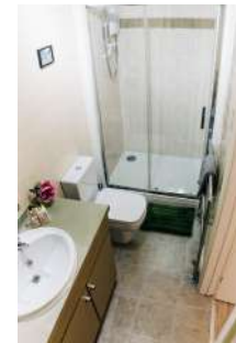
Ground Floor Shower Room