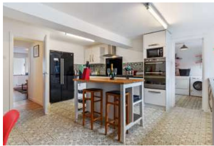
Kitchen & Kitchen Bar