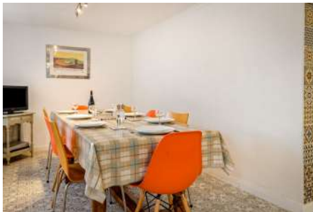
Kitchen Dining Area