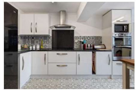
Kitchen Appliance Positions