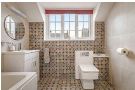
First Floor Bathroom