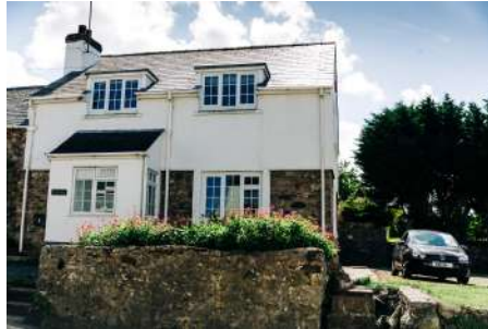
Slope to Entrance Porch