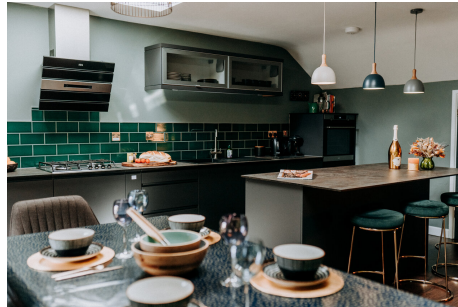
Kitchen & Dining