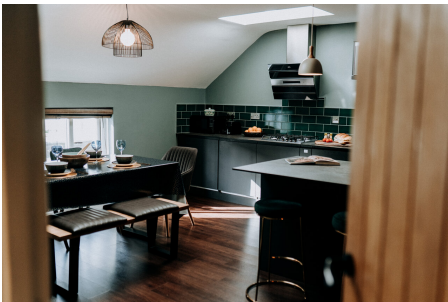
Kitchen & Dining