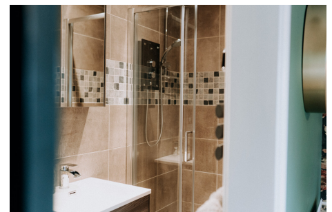
En-suite Shower Room