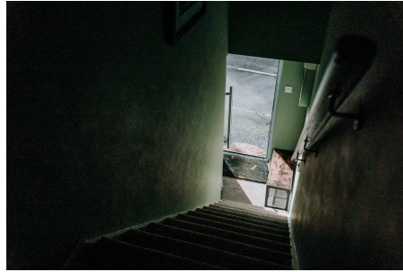
Stair to First Floor