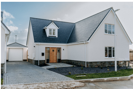
Entrance Door & Drive