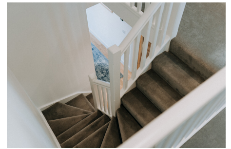
Winding Stair to FF