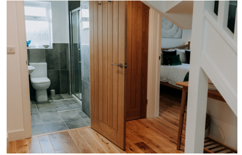
Hall to Shower Room