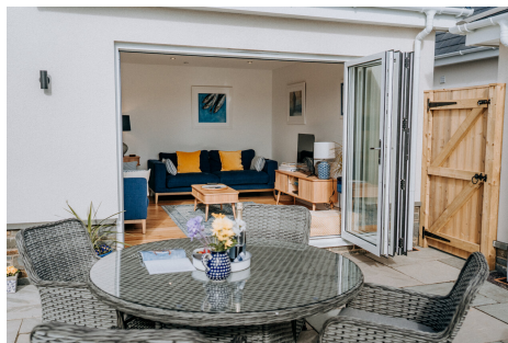
Terrace (Bi-fold doors to lounge)