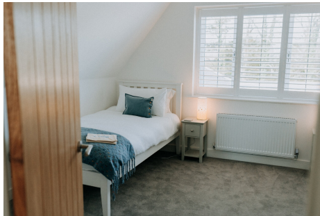
FF Twin Bedroom