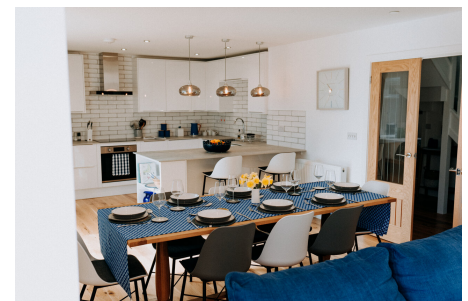
Kitchen & Dining Area