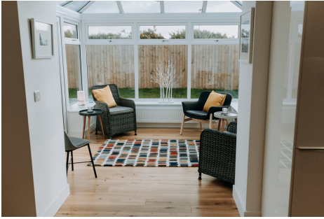
Level Access to Sun Room