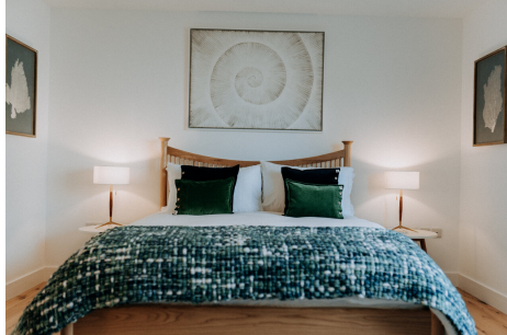
GF Kingsize Bedroom