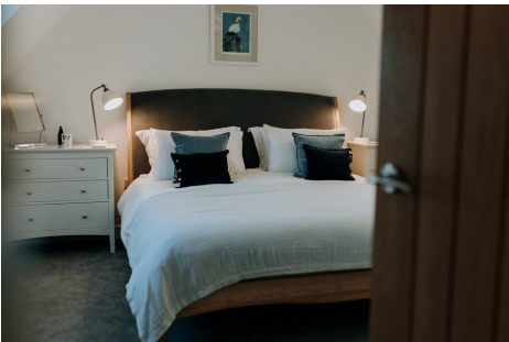
FF Kingsize Bedroom