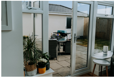
Sun Room Door to Garden