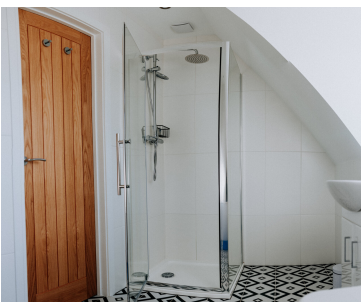
FF Ensuite Shower Room