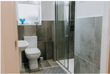
GF Shower Room